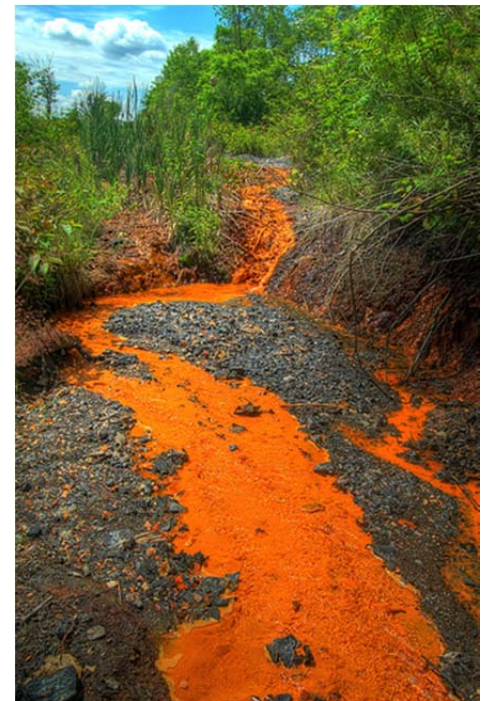
Acid mine drainage in western Pennsylvania

Background: In 2012, the Maine Legislature passed a bill to weaken Maine's mining regulations, at the request of J.D. Irving Limited, a huge Canadian conglomerate and the largest landowner in Maine. Open-pit mining refers to a type of mining where metals and other substances are removed from the earth from an open pit, as opposed to tunneling through the earth. Most of the discussion during the legislative session focused on J.D. Irving's Bald Mountain site in central Aroostook County, but there are many other places in Maine where open-pit mining could occur.