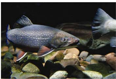
Eastern brook trout

During the 2012 legislative session debate, Irving’s lobbyists promised the company would treat the contaminated water from an open-pit mine at Bald Mountain, but will they treat it for hundreds, even thousands of years? That’s how long sulfide deposits can continue to produce AMD. Do Maine people want large treatment plants in the North Woods for the next thousand years? Will mining companies pay to operate such treatment plants for centuries ?